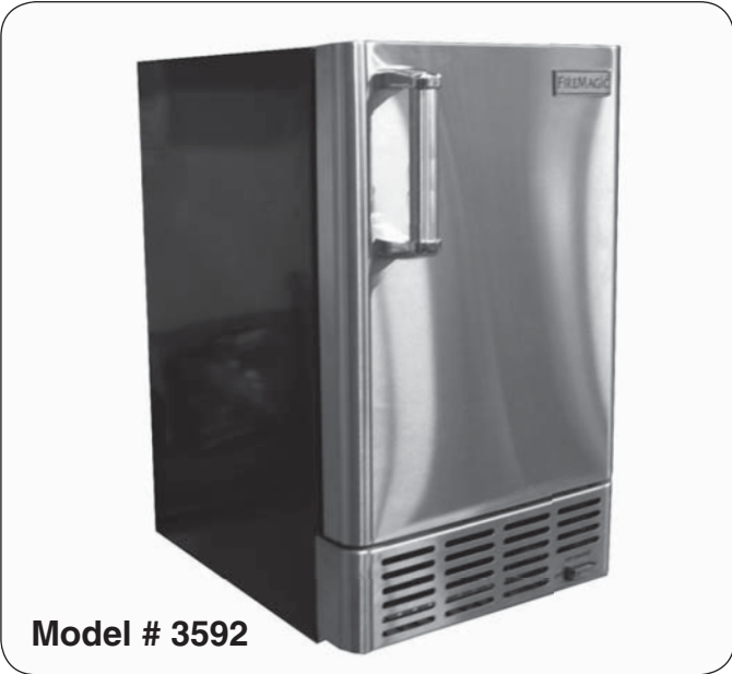
Model # 3592

INSTALLER: Leave these instructions with consumer. CONSUMER: Retain for future reference.