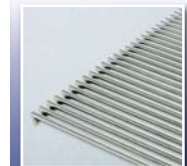
Solid Stainless Steel Cooking Grids