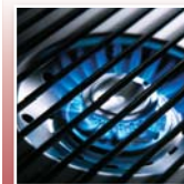
Stainless Steel Side Burner