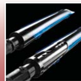
Stainless Steel Dual-Tube™ Burner System