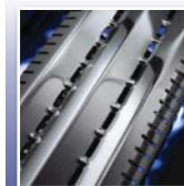
Stainless Steel Flav-R-Wave™ Cooking System