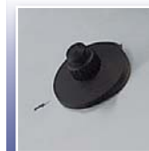
Sure-Lite™ Electronic Ignition System