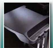
Perma-Mold™ Drop Down Side Shelves