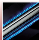
Stainless Steel Tubular Burner System