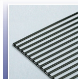
Porcelain Coated Cooking Grid