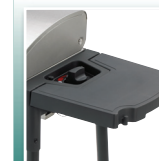
Durable Resin Side Shelf